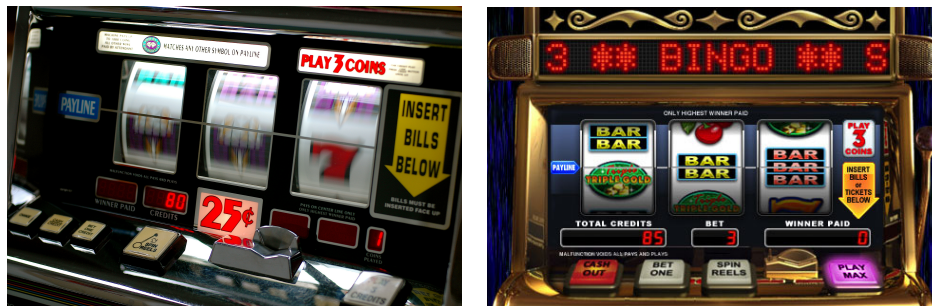
Figure 1: Mechanical Slot Machine (left) and Video Slot Machine (right)

If a player ceases to play, i.e., the EGM is idle for a specified amount of time, the machine starts playing an attract animation until a new player inserts a coin or presses one of the buttons.